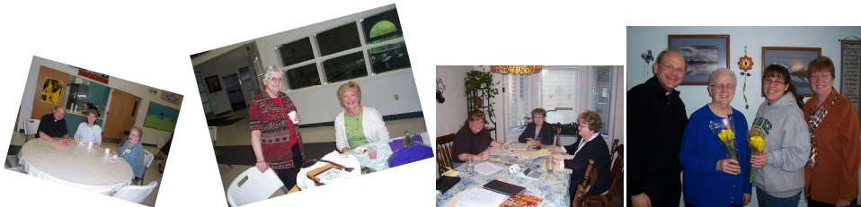
Newly elected officers 2010