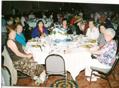
Evening Fun at the banquet.

Come to the meeting, September 9th and find out more about the Convention in Buffalo, New York. These conventions are an experience not to miss. In two years there will be another convention in Omaha, Neb. .... think about it!!!