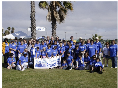
45 team members participated in the 5K walk For more information about CAN visit: www.cureautismnow.org

The Autism Project PTA joined forces with parents, teachers, children and community supporters to make a strong presence at the CAN – Cure Autism Walk on June 10, 2006. This was just one way we could give back to the community who helps our children. We want to thank each and everyone who came out that day and anyone who sponsored a walker with a donation. GREAT JOB team!