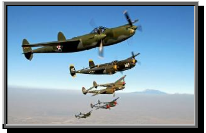
Five of the seven flyable P-38 Lightnings flying from Chino to Sacramento for an air show. One of the Lightnings had to drop out and land at Fresno due to mechanical difficulties. The fourth one down in the “stack” is the P-51 that was in our Museum Hangar for awhile. It was at the Wings over Camarillo air show.