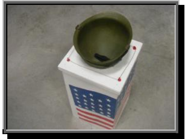
Here’s our Wing Ballot Box, which will be stationed in the “O Club” between October 15 and November 15. All members in good standing are encouraged to vote.