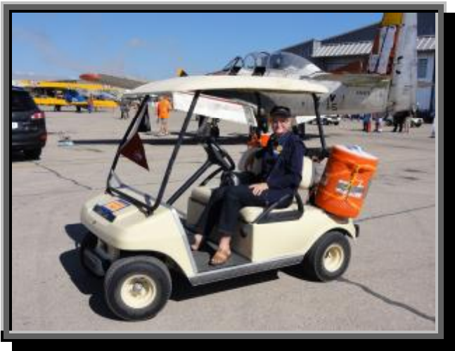
Pat Brown doing her annual stint with the Water Cart at Airsho 2010 in Midland, TX on October 9 and 10.