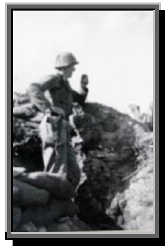
An Air Force forward observer – Korea, early 1950s

On a couple of occasions, I was the forward observer. But most of the time I sat in a bunker with the Air Force guy on one side and my unit's radio operator on the other side. I was sort of a referee, and made sure that what the Air Force was saying made sense to the Army. To help - I had a full set of 8 1/2" x 11" photographs taken from every outpost across the battle front. While I was not often on the front line, I had pictures of what the guy on the front line was seeing. Sounds complicated, and it was, but we didn't know any better, so we just did it.