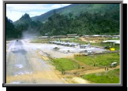
This is a nice shot of the field, 1969. You can see three Raven Dawgs parked, along with a lineup of T-28s, some of which might have been for the FACs, others of which might have been for USAF (with Laotian markings) or Royal Laotian Air Force (RLAF) attack missions. A USAF 21st Special Operations Squadron (SOS) CH-3E has just landed on runway.

There were "Lima Site" airfields all over Laos, and the Ravens would frequently use them when they ran low on gas or experienced aircraft problems. There were four other main bases: Luang Prabang (northwest); Vientiane, the capital; and Pakse (LS11, lower panhandle) and Savannakhet (LS39, upper panhandle) in the south along the Mekong River.