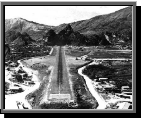
Long Tieng, Laos, Lima Site 20A (LS20A) taken out the side door of an HH-53.

"Karst formations rose on the right at the south end, making approaches a hair-raising event, especially when the weather was bad."