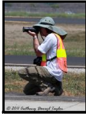
See pages 6 & 7