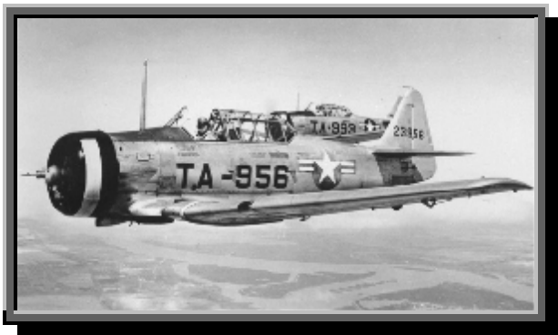
North American AT-6 Texans – used as spotter planes in the Korean Conflict – known as "Mosquitoes."

The aircraft operated at the limits of their range, so they didn't have much time to dally around the target area looking for something to blow up. Existing radios did not allow for direct communication with the ground (forward observers) for help in finding their target. The solution was to use pathfinders as they did in Europe to lead attack aircraft to the target. Initially, Army liaison aircraft were used - but they were not much more than Piper Cubs in olive drab. L-birds were quickly replaced with AT-6s, which had been given to the Korean and Japanese post-WWII military. The 6147th Tactical Air Command was formed and they were called "Mosquitoes."