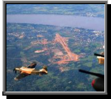
Savannakhet Airfield (LS39) taken from a flight of Sandy A-1s in 1971. Thailand is across the Mekong River.

There were "Lima Site" airfields all over Laos, and the Ravens would frequently use them when they ran low on gas or experienced aircraft problems. There were four other main bases: Luang Prabang (northwest); Vientiane, the capital; and Pakse (LS11, lower panhandle) and Savannakhet (LS39, upper panhandle) in the south along the Mekong River.