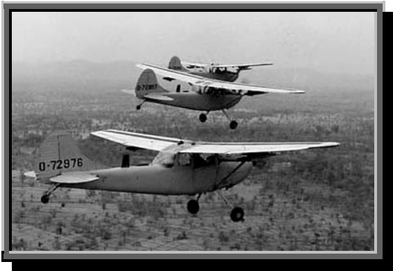
Three Raven Bird Dog FACs flying in formation over Laos. Note they are grey fuselage, small numbers on the tail, no national markings. They are flying over Pakse, a southern base for the Ravens. Larry Ratts, Dunc Duncan and Jim Hix. Photo credit: Frank Kricker. Presented by ACIG.org

Rather than telling war stories, we'd like to show you some of the men, their machines, and the "bases" in Laos from which they operated.