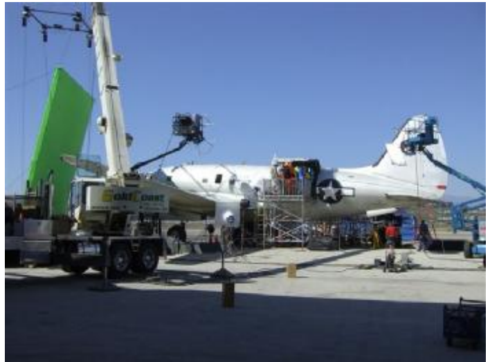
A recent advertising “shoot” involving our C-46 China Doll . You may have seen it in a recent Centrum Silver vitamin commercial on television.