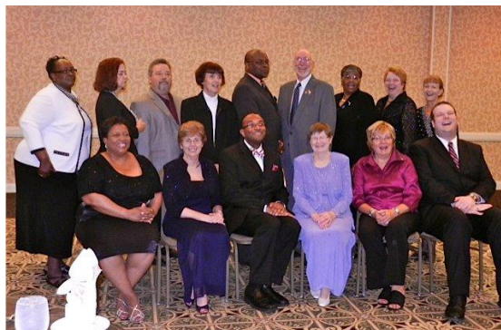
2011-2013 Officers of NAP

http://www.facebook.com/#!/parliamentarians