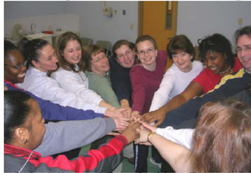
Orientation and Teambuilding Retreat March 5, 2011 9:30am -3:30pm

Academy Workshops: Thursdays 5:30-8:30pm 12 weeks beginning in March At Asnuntuck Community College Conference Center