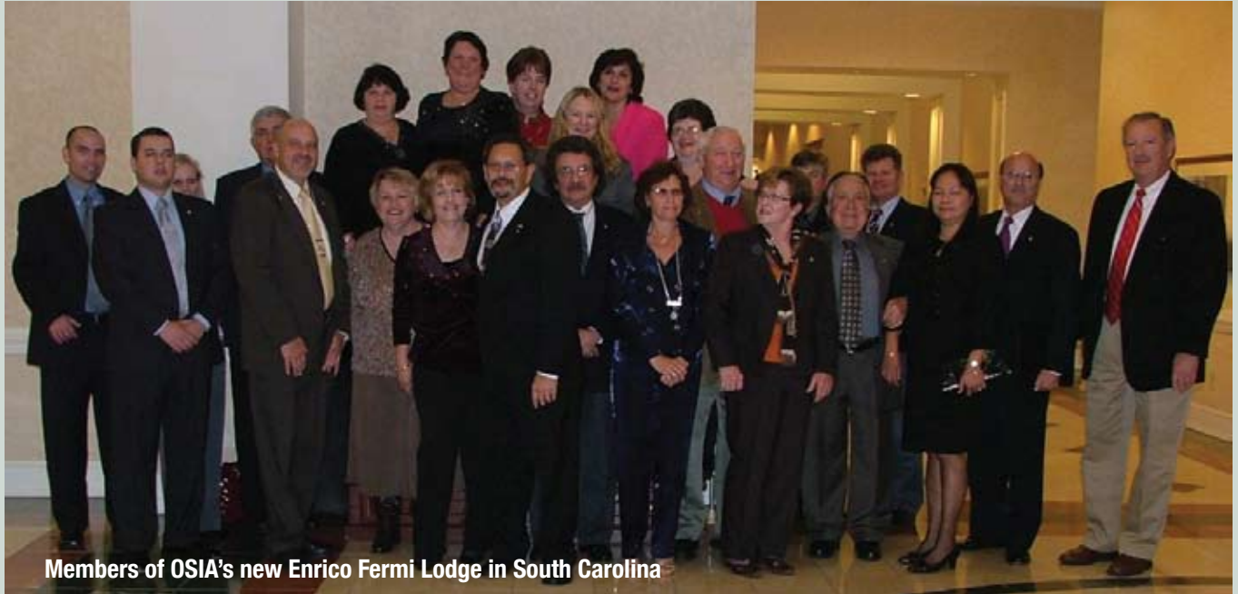
Members of OSIA's new Enrico Fermi Lodge in South Carolina