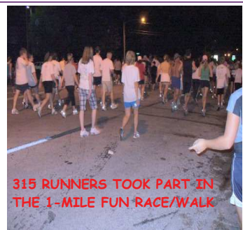
315 RUNNERS TOOK PART IN THE 1-MILE FUN RACE/WALK