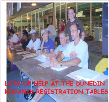
LOTS OF HELP AT THE DUNEDIN KIWANIS REGISTRATION TABLES