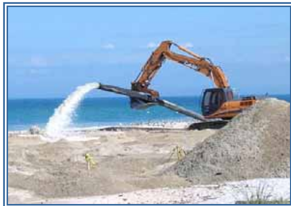
sand re-nourishment on Egmont Key

It is with great pride; we all are looking forward to the journey and forward motion of the Egmont Key Alliance to restore a light tower to the day in 1858 when she was crowned with a top. The preservation of this piece of history is a large project, a worthy undertaking, and an amazing goal. May we have success as we advance forward on this mission.