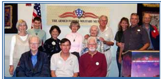
EKA members at the Armed Forces Military Museum

http://www.armedforcesmuseum.com/afmm-exhibits.html