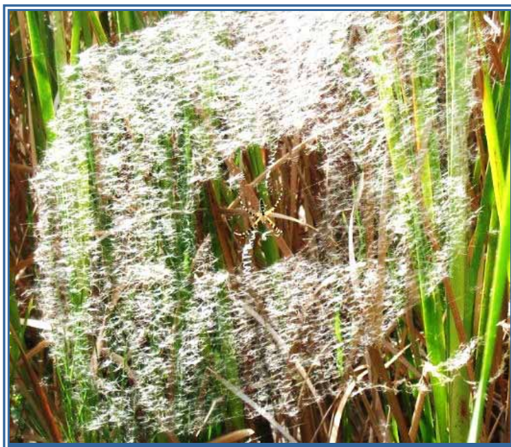
Female Yellow Garden Spider on her web

the web over a conspicuous zigzag band of bright white noncapture silk known as stabilimentum. The female usually eats her web each day and constructs a new one. Females can handle prey much larger than themselves, including grasshoppers, katydids, cicadas, June beetles, moths, wasps, bees, and other insects.