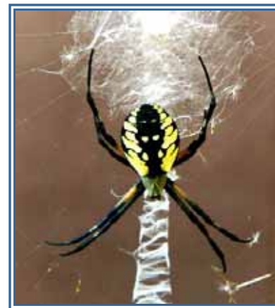
Yellow Garden Spider

Females build large webs, up to two feet in diameter, in open areas among tall grasses and weeds, often in wet or marshy areas. The web consists of dry spokes supporting a spiral thread of adhesive silk. The hub is separated from the spirals by a free zone. The spiders rest head down day and night at the hub of