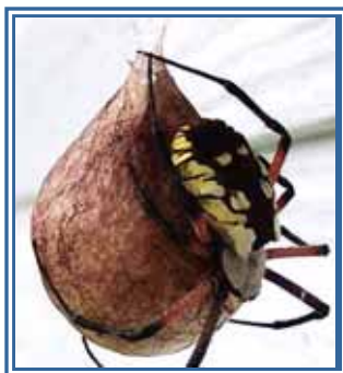
Yellow Garden Spider with egg sac

Spiders reach maturity in summer. Although males build webs, after they reach maturity they wander in search of females, and they can be found in the females' webs. Light brown, oval or spherical egg sacs up to an inch long are produced in late summer or early fall. Each sac contains up to a thousand or more eggs. Spiderlings winter over inside the sacs, and they disperse in the spring. Mortality due to predators and parasites can be very high. In the spring, the young spiders build small webs in low vegetation. As they grown, they tend to build larger and more conspicuous webs higher in vegetation. These spiders are not dangerous to people, and their bites result in nothing more than a sore, itchy swelling that goes away in a few days. I hope she has a playmate on Egmont Key.