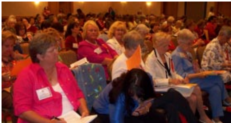
Members ready for both business sessions