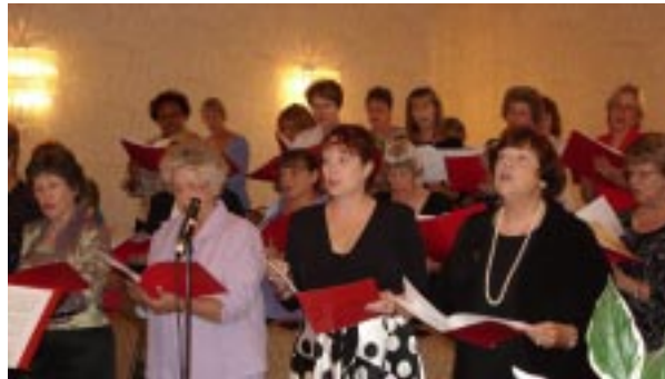
The outstanding Mu State Chorus