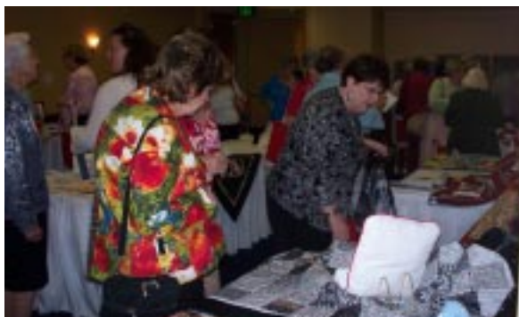
The arts and crafts exhibit was a huge success