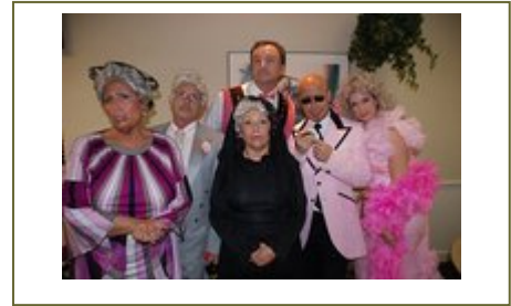
Murder Mystery Dinner: My Big Fat Italian Funeral– April 6, 2011

Our scholarship committee has been very busy. Our club decided that we would offer scholarships for Educational Interpreters to help with their exams, etc. Our applications are ready and are being distributed. We hope to give at least one scholarship this year. In February we are having a Wine Tasting Social with our members. It should be a lot of fun. We are very busy working on our big fundraiser to be held on Saturday, April 9 at 6pm . We will be hosting a Murder Mystery Dinner titled My Big Fat Italian Funeral . I will email all of the Club Presidents with the information to share with your members. So as you can see QI of North Broward has been very busy!