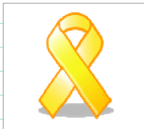
Every little bit helps

At our August meeting, many suggestions were made about possible community service projects. Residing at the top of the list were making cards for Veterans Day, and taking them to the Veterans home, holding a baked goods drive at Thanksgiving for the