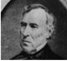
Zachary Taylor The Twelfth President • 1849-1850