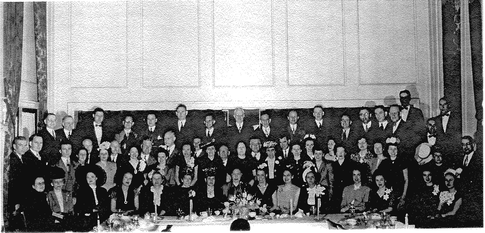
FIRST BOSSES NIGHT

First Boss' Night, Minisa Chapter IAAP – November 2, 1944 at the Lassen Hotel.