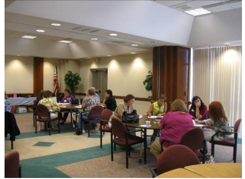
Kansas Division Leadership Workshop, Flint Hills Technical College, Emporia