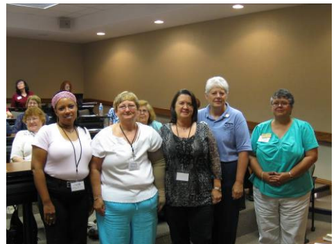
Recognition of Kansas Division's 2009-2010 Members of Excellence: Johnson County, Kaw and Heartland chapters