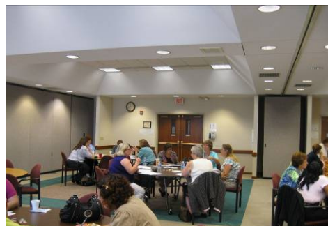
Kansas members working on Kansas Division's strategic plan update