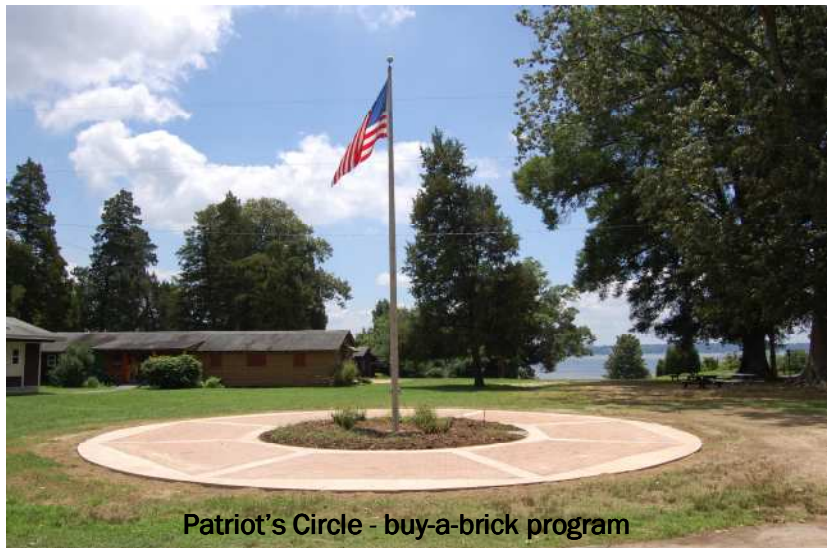
Patriot's Circle - buy-a-brick program

The tractor and loader used to excavate the circle area was donated by Bud Humbert. The excavated fill was removed by Bill and