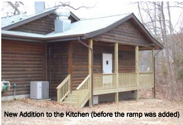
New Addition to the Kitchen (before the ramp was added)

We can be very proud of the addition to the kitchen and dining hall at LCM. The project was completed with $45,500 in funding from LCIF along with equal funds from the following Lions Clubs and others: Accokeek-Bryans Road LC, Paul Bolton, Bowie LC, Burtonsville LC, Calvert County LC, College Park LC, Damascus