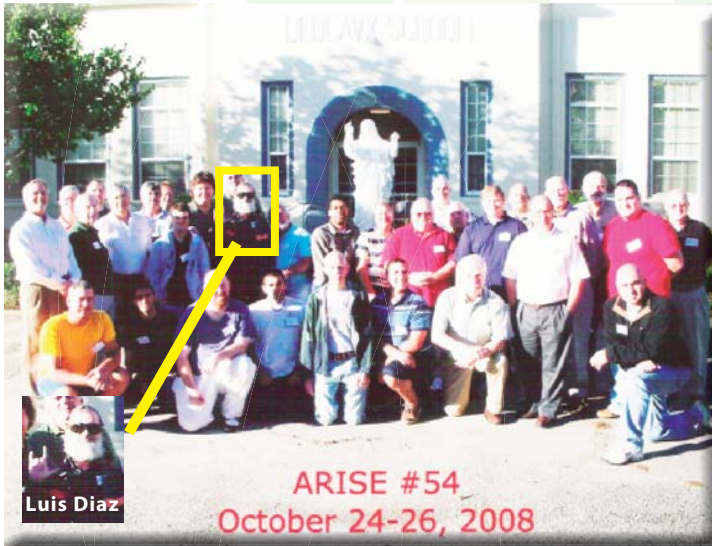
ARISE #54 October 24-26, 2008