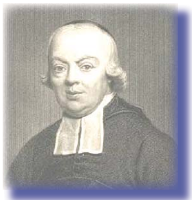
Abbe Charles Michel de l'Epee