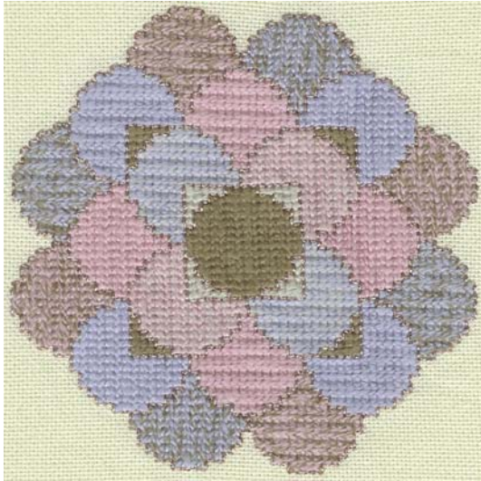
SWEDISH TVISTDOM TRIVET