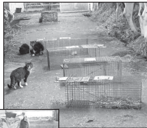
Above: the waiting game.

Far more often than most people realize, Cat Coalition volunteers spend hours dealing with feral cat colonies. Most of the time, the caretakers of these cats cannot afford to do anything more than feed them. CNYCC frequently has to fund these surgeries and vaccinations to control the breeding, reduce unwanted behaviors and insure healthy cats. Trapping, transporting, recovering the cats after surgery and providing shelters, if needed, all fall onto these dedicated volunteers. A special donation at this critical time would greatly help us continue with this work. Thank you for your support.