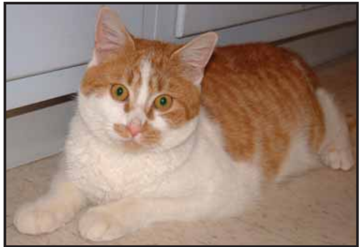
"Clancy"

His wait was worthwhile as a woman fell in love with Clancy. After his adoption, she wrote that he is quite the character. Renaming him Mr. Clancy Fancy Pants, she says he is very tidy – as he washes his stuffed toys several times a week in his water dish and then leaves them out to air dry, where she always manages to step on one when she is half asleep. This may be his alternate method of seeking attention because he is too polite to really demand playtime. Clancy will gently tap her on the arm until she awakens to pay attention to him. It sounds like he really hit the jackpot when he found his new "mom."