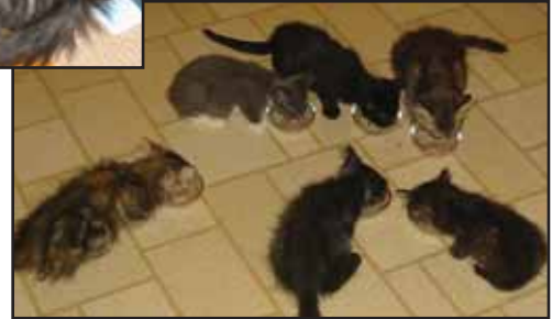
Below - Dora, Wuss, Tom Thumb and Thumbelina are shown by others how to eat on their own!