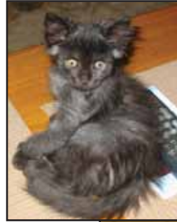
Left - Tom Thumb making himself at home.

In addition, she referred a friend to our volunteer after he found six kittens abandoned at his barn. Through the foster volunteer and the Coalition, he received advice and help with veterinary care. During recovery from their spay and neuter operations, he became so attached that he adopted all six into his home!