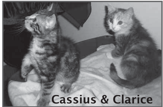
Cassius & Clarice