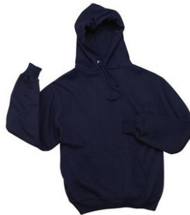
50/50 Cotton/Poly Hoodie Sweatshirt