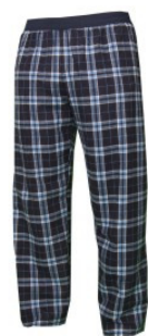
100% Cotton Flannel Pants