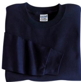
100% Cotton Long-Sleeved Tee Shirt