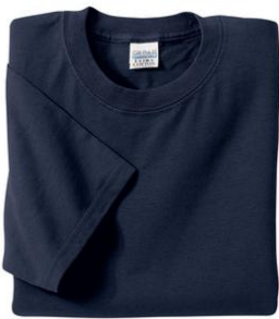
100% Cotton Short-Sleeved Tee Shirt