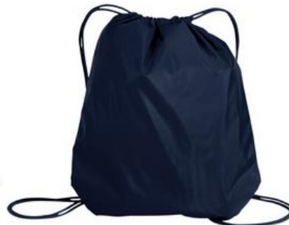
Cinch Style Backpack 100% Nylon – 14.5"x16.6"

Kindly make checks payable to RJ Lockhart PTA (no cash, please!). Return your order with check in an envelope marked "PTA – Spiritwear" If you need further information please contact Marta Kiernan @ 798-6107.