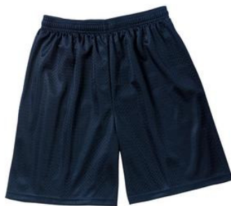
Mesh Shorts (7.5" inseam)