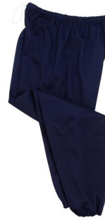
50/50 Cotton/Poly Sweatpants