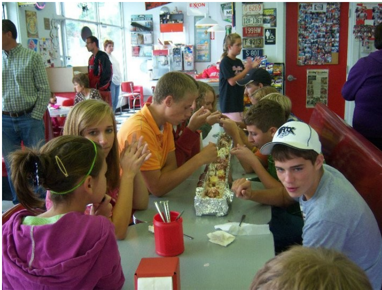
FROGs enjoy a fun afternoon at the ice-cream trough in Mount Vernon