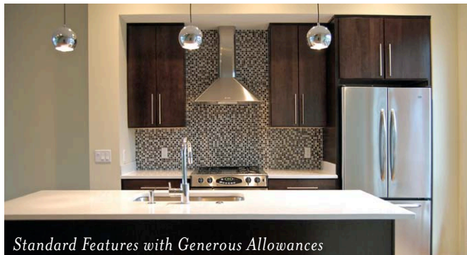
Standard Features with Generous Allowances