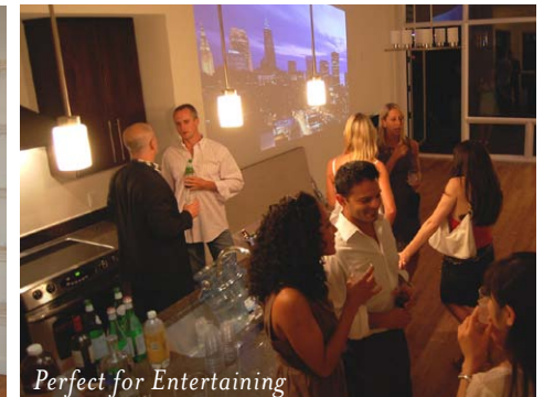
Perfect for Entertaining