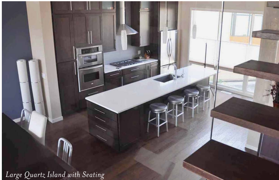
Large Quartz Island with Seating

The 27 Colman environment is designed for residents who place a premium on leisure time and desire maintenance-free living. Residents can rely on a talented design board comprised of the area's finest tastemakers to assist with the interior at the expense of the builder.