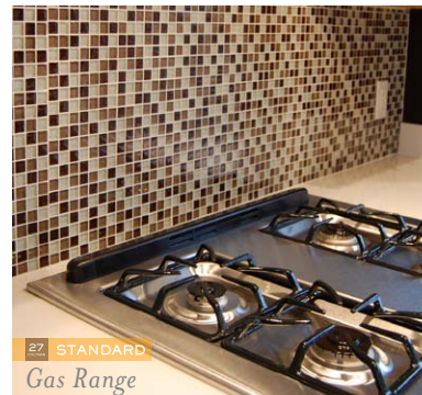
27 STANDARD Gas Range