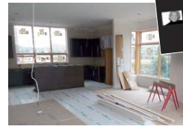
Customizable kitchen space