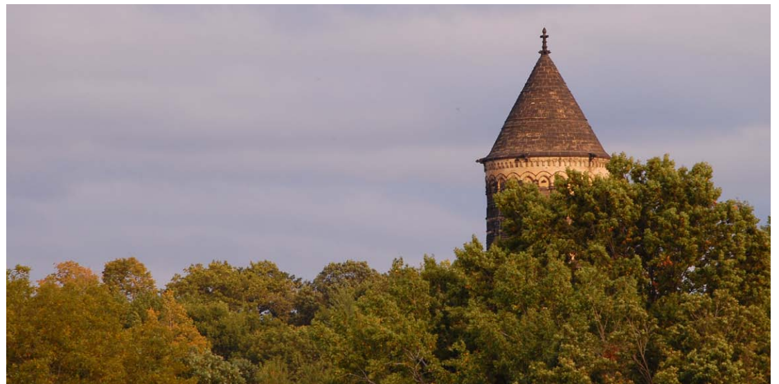
Looking Southwest—Garfield Memorial