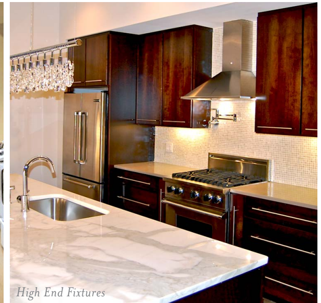
High End Fixtures