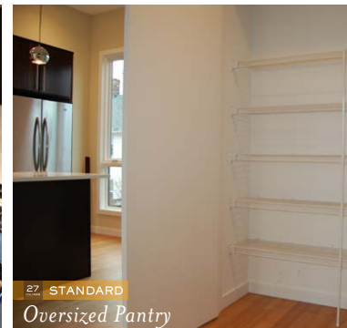
27 STANDARD Oversized Pantry