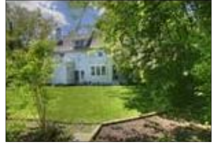
Pretty yard. Landscaped. Fully fenced. Two car garage.

Abundant cabinetry, loads of work space, planning desk...all open to large family eating area.