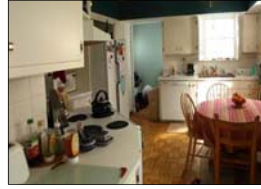
Bright fresh eat-in kitchen with all appliances included. Mud room to yard.