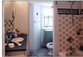
4 bedrooms and updated tiled bath on 2nd plus a connecting half bath.