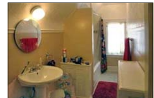
Loads of light and open space and great storage.

Great 3rd floor au-pair or teen suite option. Schneider design. Four to five bedrooms. Two full and two half baths.