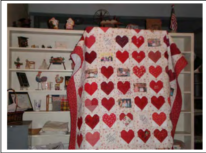
Beautiful heart quilt everyone helped make for Pat C.