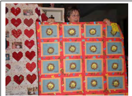
One of the quilts made for the Jefferson Early Childhood Development Center to be auctioned by the school.

Trash/Treasure Box. There will be a trash or treasure box on the table where you sign in. The purpose of this box is for anyone who has left over fabric from a project or anything pertaining to quilting that you no longer want or need but you know there is someone who could use them. Please bring these things and put it in the box and everyone is welcome to look and see if there is anything they could use, and if so, please take it. This is your chance to clean up your sewing room, share with others, and not feel guilty about throwing away a scrap of fabric.