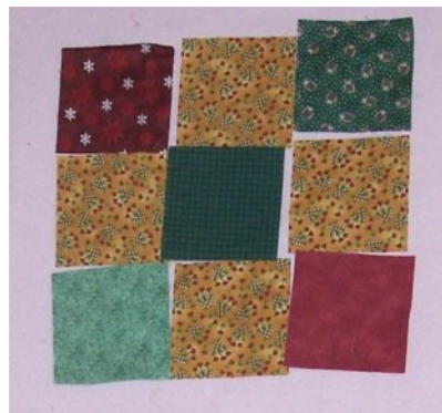
Here is a layout for the BOM.

BOM was given by Carolyn McDonald who stood in for Vonnie. It was a simple 9-patch with 4 blocks being provided and must be in the correct placement. The remaining 5 blocks can be filled in with any red and/or green fabric and one should be Christmas fabric.