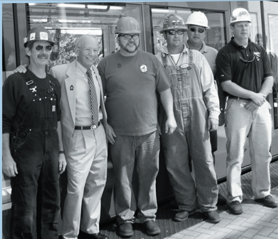
Congressman DeFazio in Portland with members of Oregon Ironworks at the opening of the the first domestically manufactured streetcar in 70 years. DeFazio legislation helped create the project, which could generate hundreds of jobs in Oregon.

A robust economic recovery is threatened by a deteriorating highway network and congestion in our urban cities and ports. Decades of under-investment in our transportation infrastructure have taken a toll. Almost 61,000 miles on the National Highway System are in poor or only fair condition. More than 152,000 bridges are structurally deficient or functionally obsolete. The nation's transit agencies have billions of dollars in deferred maintenance putting lives at risk. As a result, America is falling behind. Investing in a vibrant and modern infrastructure would make America more competitive and is a proven way to put millions to work helping to jump-start our lagging economy.