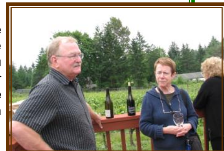
Wine Tasting at Springhill Winery

The stop at Coelho winery is our farewell gathering to which all members are invited. Space on the full day trolley outing is limited so send in your reservation (on back page) soon.