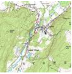
Scouts & Family