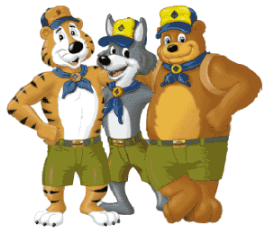
Scouts & Parents

Let's go Camping! We will participate in an Orienteering Race. Not a Camper??? Just come for the race and a day in the park. We will also play Frisbee golf and do some fishing. Race Fee $5 per scout, camping / meals $25 per person. Contact me if you have not signed up yet! Visit www.scoutorienteering.com for more info.