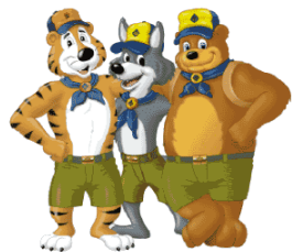
Scouts & Parents

If you placed 1 st , 2 nd or 3 rd in your den then you qualify to represent Pack 24 at the district wide race. Registration fee is $3 and starts at 8:30AM, racing starts at 10AM. Butler Elementary is located off 202 (at 7-11 store) at 200 Brittany Dr Chalfont.