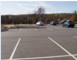
Scouts & Family

First chance to pay for Camp Kirby at a discounted rate.