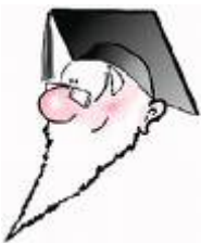
Parents & Leaders Only

Camp Kirby – Aug 8 – Aug 11 - Jungle Theme, Camp Fees range depending on registration date, between $165 (by April 30) to $180 (after May 1). @$15 for additional meals, snacks and activities. Photo @$8, $10 Camp T-shirt. We will do a fundraiser to reduce costs!