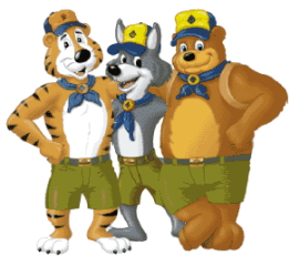
Scouts & Family

For $5 per scout and $10 for non scouts, you can have the evening for yourselves. Do not bring your own games or equipment unless requested. The games will be projected on big screens. Games: Mario Kart Racing, Dance Dance Revolution, Super Smash Brothers, Lego Star Wars and more. There will also be board games and a movie. Walk-ins welcome.