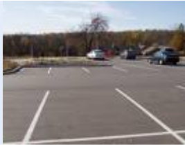
Scouts & Family

It's gold rush time!!! The boys, as a team, get to compete against other packs in cub scout games and skills to earn gold nuggets. The pack with the most nuggets at the end of the day wins. This was a great event last year, and promises to be better this year.