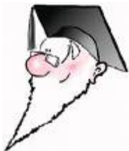
Parents & Leaders Only