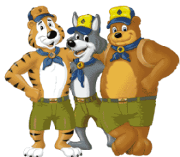
Scouts & Family

It's gold rush time!!! The boys, as a team, get to compete against other packs in cub scout games and skills to earn gold nuggets. The pack with the most nuggets at the end of the day wins. This was a great event last year, and promises to be better this year.