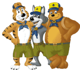
Scouts & Family

For $5 per scout and $10 for non scouts, you can have the evening for yourselves. All games will be provided and pre-screened by the leadership, do not bring your own games or equipment unless requested. The games will be projected on big screens. Games: Mario Kart Racing, Dance Dance Revolution, Super Smash Brothers, Lego Star Wars and more. There will also be board games and a movie.