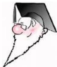
Parents & Leaders Only

Camp Kirby – Aug 8 – Aug 11 - Jungle Theme, Camp Fees range depending on registration date, between $155 (by March 18) to $180 (after May 1). @$15 for additional meals, snacks and activities. Photo @$8, $10 Camp T-shirt. We will do a fundraiser to reduce costs!