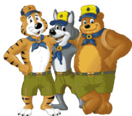
Scouts & Family

Parent Pine Wood Racers – This year we have added a parent/WEBELOS II race. The entry fee is $5 for parents. Let me know if you want to register, and I will get you a car kit.