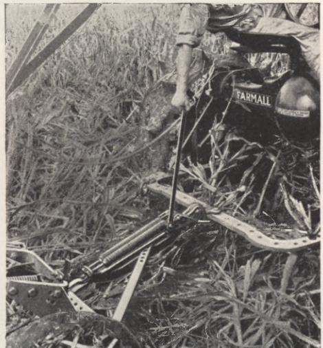
Illust. 7. This shows how easy it is to recouple the Little Genius to the tractor after the spring release hitch has operated to release the plow on striking an obstruction. All Little Genius plows are now equipped with this feature.

and recouple. The plow can then either be raised to pass over the obstacle or backed far enough for the operator to remove the obstruction and proceed with the plowing without leaving a skip.