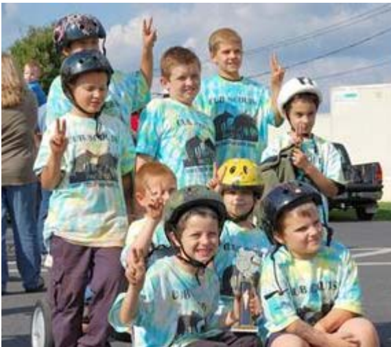
Pack 50 winning team.

The 2008 Klondike Derby will be held on February 8th – 10th at Akeland at Settler’s Camp in Jonas, Pa. It is being sponsored by Troop 36 out of Roseto. The theme this year is “The Great Alaskan Race”. The units which will be attending should be sure to practice their knot tying skills, first aid, and fire building. It is sure to be a great event so let’s have a great turnout!