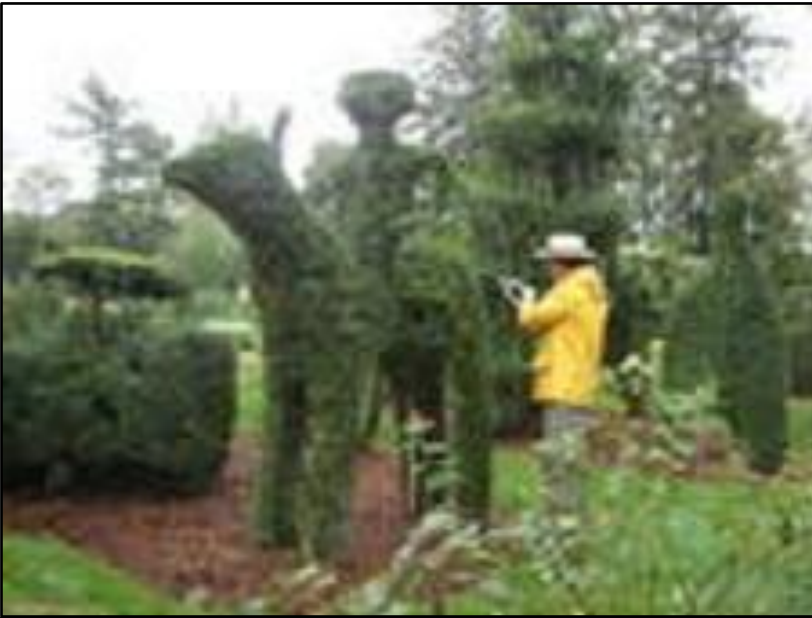
New member Eugene Platt trims the equestrian topiary at Green Animals in Portsmouth, RI. The rider has been transformed from male to female.