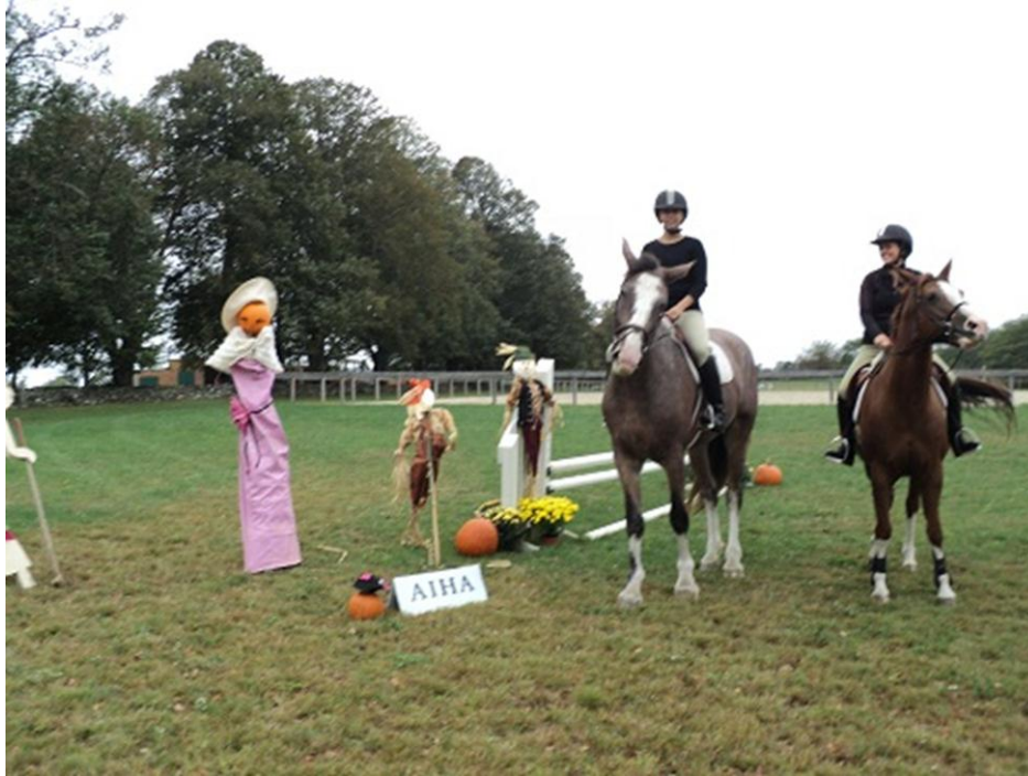
AIHA Jump at the Hunter Pace

Aquidneck Island Horseman's Association, Inc