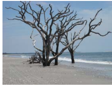
Photo taken of the beach at Botany Bay

A jewel not to miss this summer is to take a day trip to Botany Bay Plantation on Edisto Island. Botany Bay Plantation is 4,630 acres and consists of two large plantations: Bleak Hall and Sea Cloud. The last owner bequeathed the plantation to the State of South Carolina on her death. It is now a DNR Wildlife Management Area. The managed area encompasses an unspoiled beach so cluttered with shells that as the waves wash up on the shore one can hear the shells clatter against each other. Skeletal remains of trees on the beach are a dramatic backdrop to tumbling ocean waves. Cabbage palmettos and huge live oaks whose boughs are festooned with resurrection fern are common features of the exquisite maritime forest. There is no charge to visit the beautiful area. A visit to the website address below will paint a fuller picture of this beautiful area.