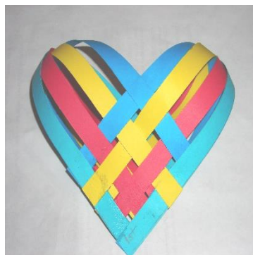
Figure 8: 6. Fold the heart in half and match ends and glue front to back.