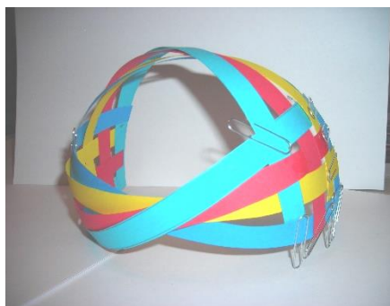
Figures 6 and 7 (below): Figure 6 shows the 3 unwoven strips on right side. Take these strips (again working inside to outside) bring over to the left, weaving in and out, gluing to left side.