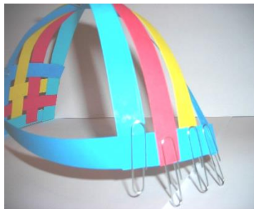
Figure 3: Take two middle strips together (not twisting) and glue right over left.