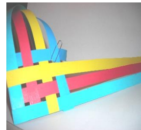
Figures 4 and 5: Take the 3 remaining weavers on left, working inside to outside, and glue strips onto right weaver. Notice top edge of heart and how strips are crossed over.