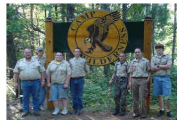
2006 group at summer camp

If $$ is an issue, check with your scout master for options.