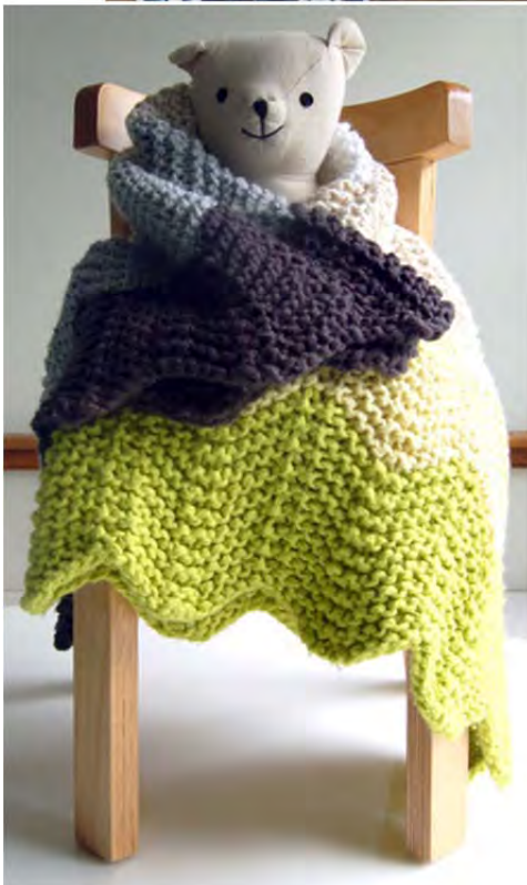
Chevron Baby Blanket

http://www.redheart.com/files/patterns/pdf/LW2020_corr.pdf