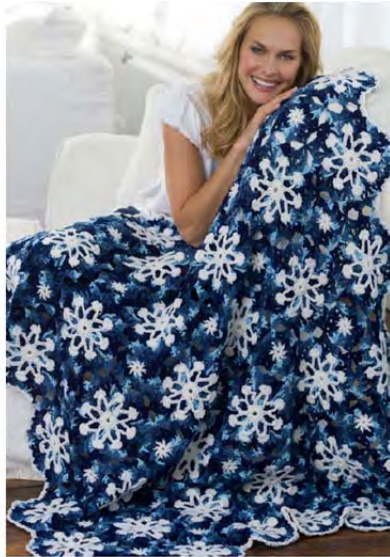
Dusty Snowflake Throw

http://www.redheart.com/files/patterns/pdf/LW2020_corr.pdf