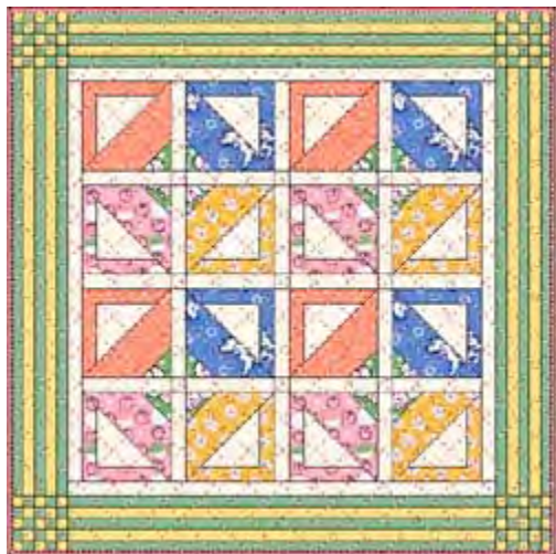
Baby Pieced Basket Quilt Pattern

Williamson, Travis, & Hays Counties of Texas