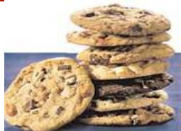
Otis Spunkmeyer Cookie Dough

Our Otis Spunkmeyer cookie dough fundraiser begins on September 29, 2010 thru October 13, 2010 .