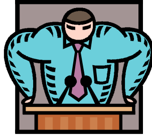
Don't Let Meeting Procedure Intimidate You!

The Chesapeake Unit of Parliamentarians will host a public seminar on parliamentary procedure as it relates to the conduct of meetings. Plan on attending this informative seminar to uncover the myths and ways to prevent yourself from being railroaded at meetings. Those of you who conduct meetings should