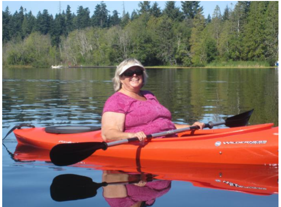
Gwen in her natural habitat