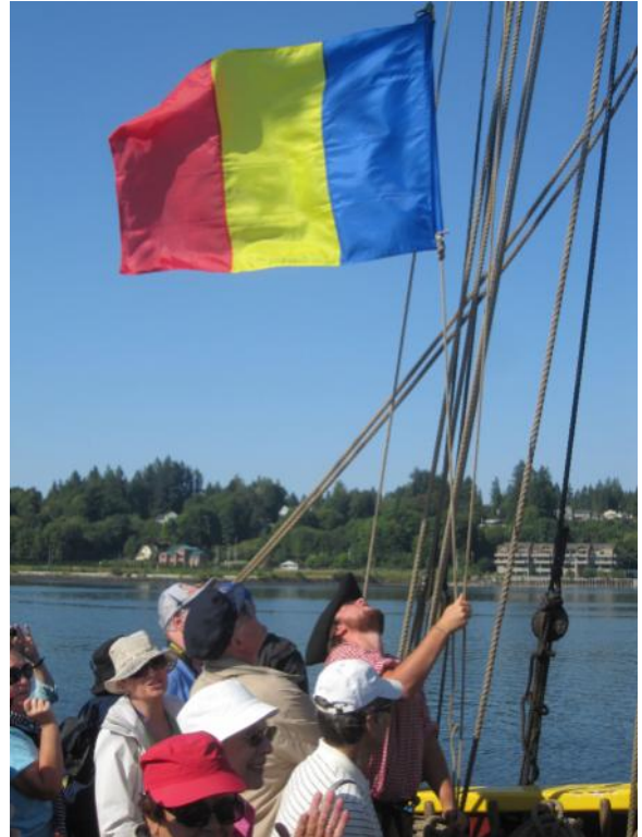
Desteapta te, Romania! , the first words of the national anthem, which some people started singing when they saw the flag go up.