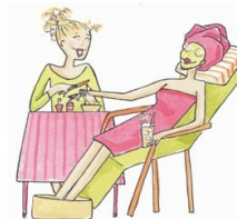
If you've got it, pamper it!

Future Meeting: March 2nd — Lazy River.. Relax and Enjoy SPA DAY!