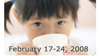
February 17-24, 2008